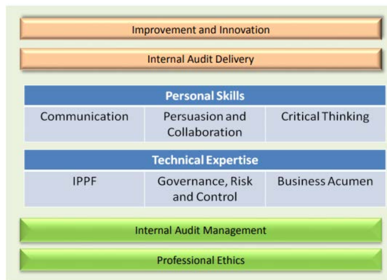
Global Internal Audit Competency Framework

In addition, The IIA’s Global Internal Audit Competency Framework , includes critical thinking as one of 10 core competencies needed to meet the requirements of The IIA’s International Professional Practices Framework (IPPF)® for the success of the internal audit profession. The Framework defines competency as the ability of an individual to perform a job or task properly, being a set of defined knowledge, skills and behavior. The Framework provides a structured guide, enabling the identification, evaluation and development of those competencies in individual internal auditors.